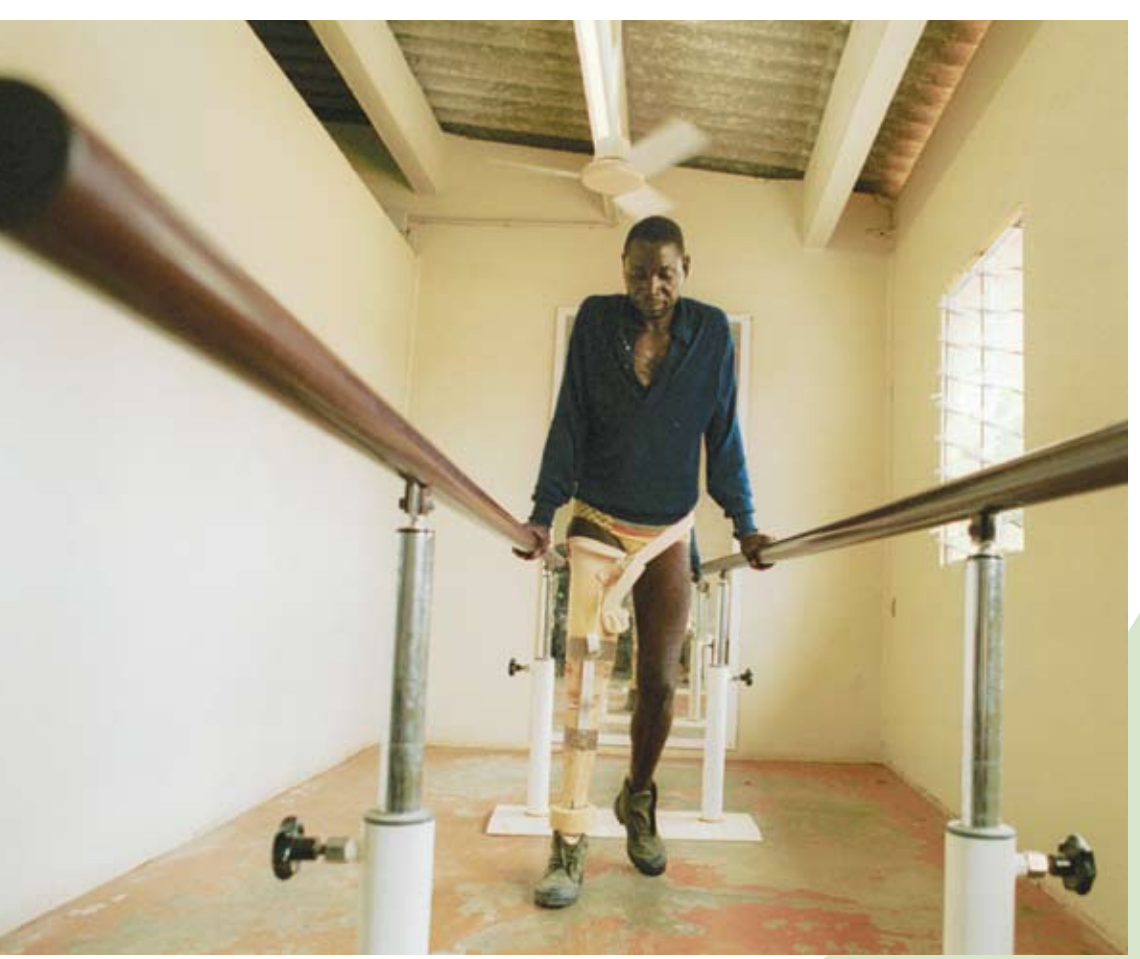
A man learns to walk again after losing his leg from a land mine placed in a war zone in Angola

"It is with a sense of deep anticipation that the Caribbean Conference of Churches and the Jamaica Council of Churches prepare to make the IEPC a memorable and life changing experience."